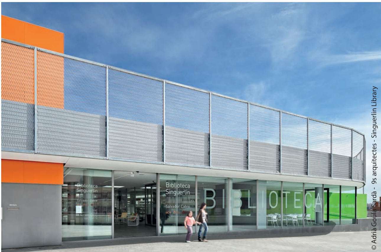
9s arquitectes - Singuerlin Library

Over the last 15 years the Library Architecture Unit has sought to systematise their approach to project evaluation, in order to learn from the successes and weaknesses of existing built projects. In 2004 a team of architects and library staff developed a questionnaire that has been used to reflect on the design and functionality of existing library buildings. This methodology has been refined over subsequent years, with the team taking a central role in the development of a POE survey for the International Federation of Library Associations and Institutions (IFLA) in 2013.