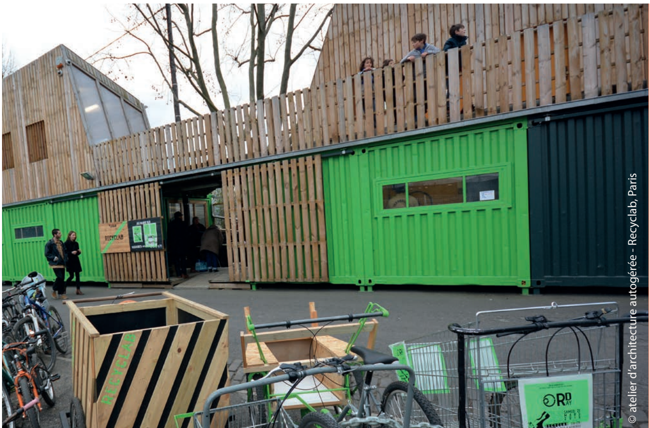
© atelier d'architecture autogérée - Recyclab, Paris