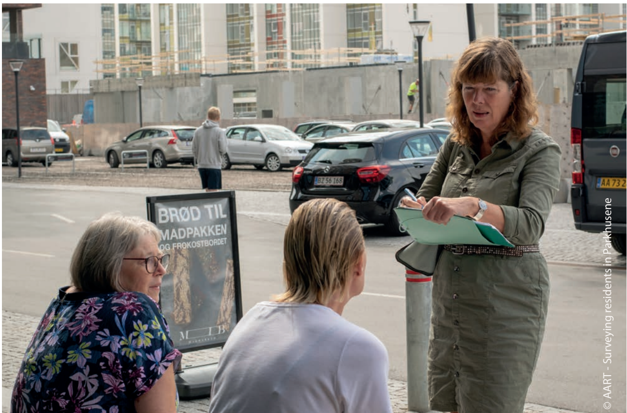
Surveying residents in Pakhusene