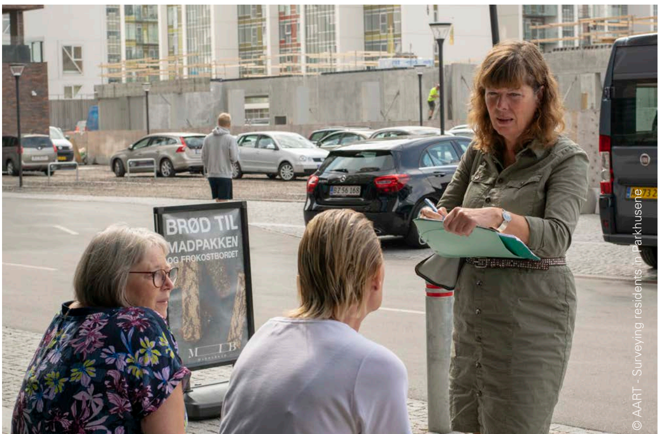
Surveying residents in Pakhusene