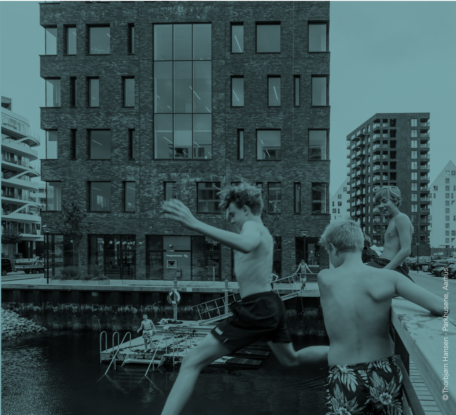
© Thorbjørn Hansen - Parkhusene, Aarhus

Demonstrating the value of design through research in European architecture practice